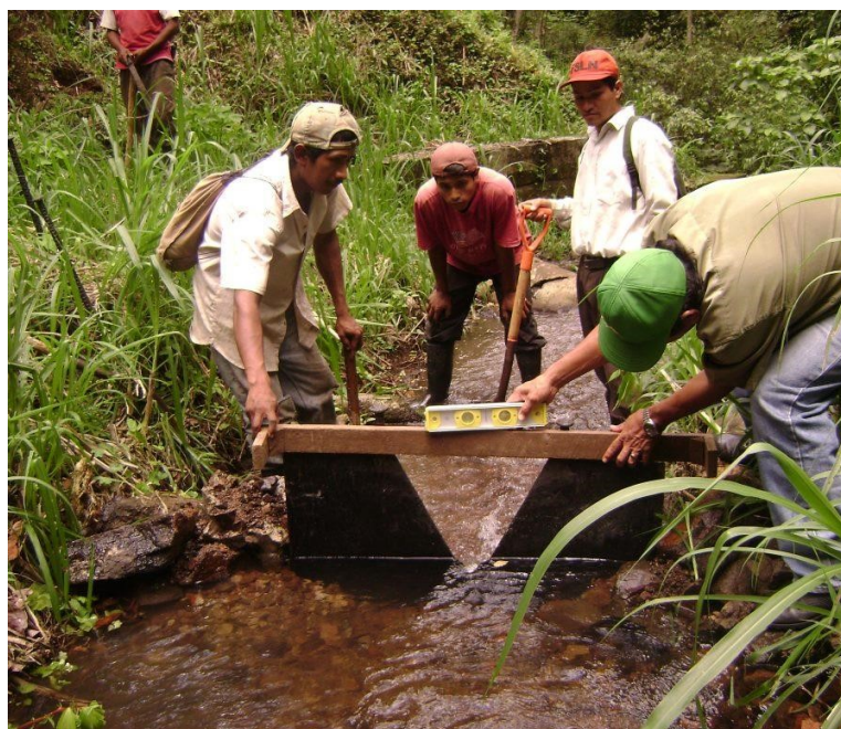
Figure 1: Caritas' project in Ethiopia